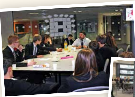
The philosophy café.