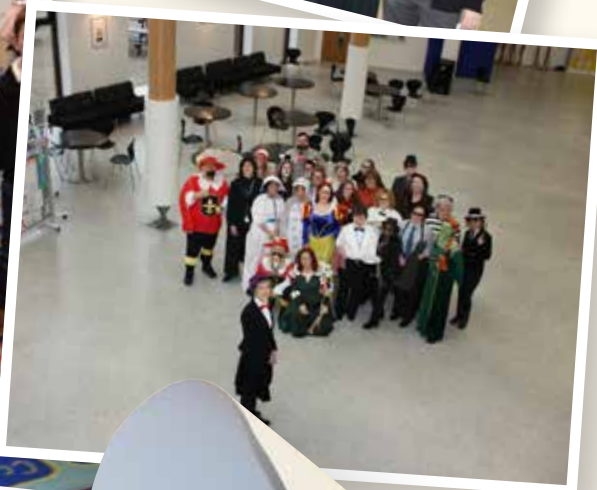
The Thomas Clarkson Academy maths department.