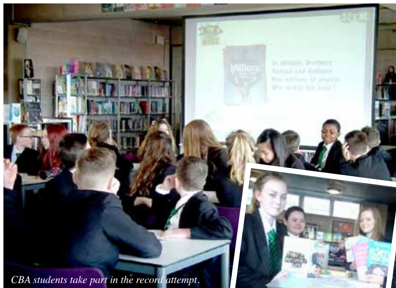
CBA students take part in the record attempt.

There have been some exciting inter-trust schools events taking place since the last edition of TRUST Education.