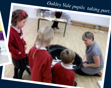
Oakley Vale pupils taking part.