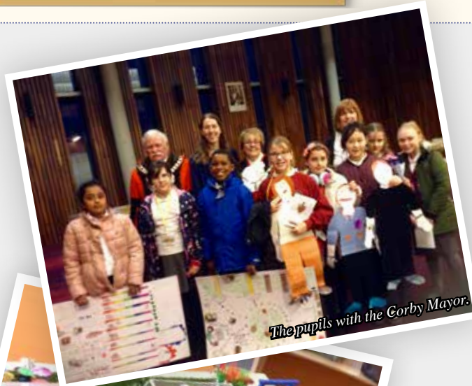
The pupils with the Corby Mayor.

Year 1 students have put on mini puppet shows after they sewed and glued their very own sock puppets. The shows were staged in little groups so that everyone had a chance to make, perform and watch. The result, as part of the toy maker topic this term really helped the students' speaking and listening skills and they were all commended for being very sensible with the glue guns!