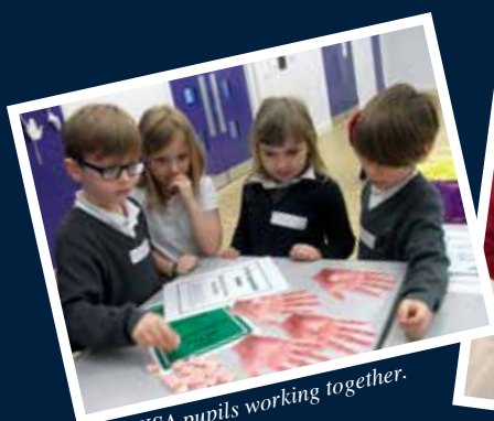
KSA pupils working together.

Year 3 pupils from all of our primaries gathered at Peckover Primary for a science event. Groups of pupils from all of our five primary schools gathered at Gretton Primary this term to take part in the Crystal Maze Challenge. Competing in teams, they were given a series of maths challenges to work through including throwing beanbags into numbered hoops, doing number bonds with paper octopi, sharing sweets and balancing tin cans. Students from each team took turns at activities and if they completed the challenge successfully they were awarded one crystal for their efforts.