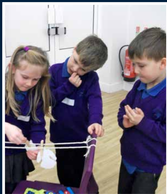
Gretton Primary pupils work out a problem.