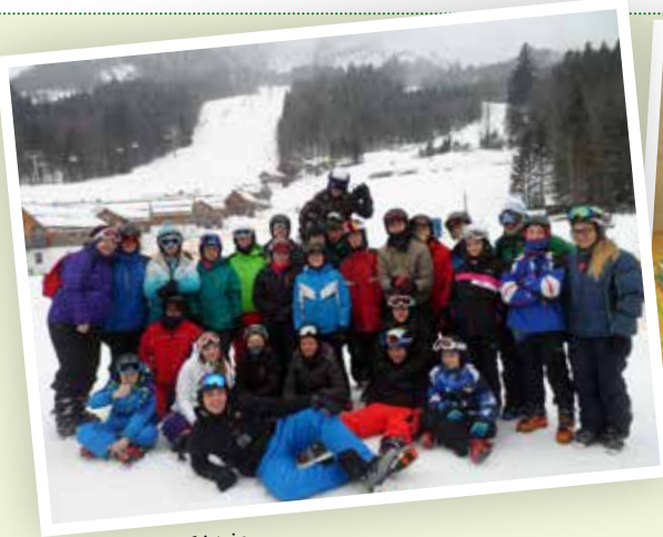
The Austrian ski trip.