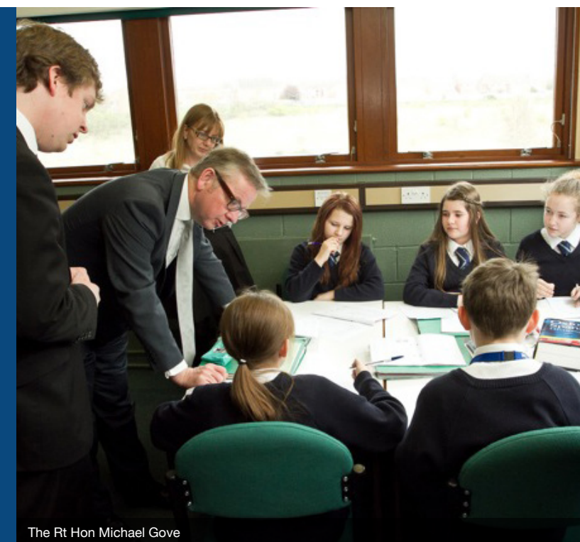
The Rt Hon Michael Gove

He said: "I have been impressed by everything I have seen here at Brooke Weston. I knew that the school was outstanding before I came here but I was very impressed by the foreign language teaching and the A-level chemistry class. It is an amazingly high level of teaching. The fact that the teachers have designed their own curriculum suggests to me that the teachers here own their school and also the children clearly are having an enjoyable time and are encouraged to be ambitious. I think that Corby is fortunate to have such a brilliant school."