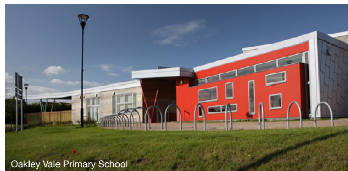
Oakley Vale Primary School

In 2001, I joined the Northampton based corporate finance specialists, Watersheds. I was instrumental in growing the company to a three-office practice with 8 partners as well as successfully completing a large number of local and national company acquisitions and disposals.