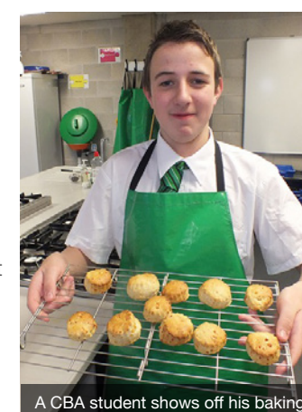
A CBA student shows off his baking

The secondary schools from across the Trust are taking part in the Great Brooke Weston Bake Off. Inspired by last year's in-house competition at Corby Business Academy, the Bake Off will see students battle against their fellow pupils to be crowned their school's winner before going through to the grand final. As part of the competition students will take part in six master classes and then carry out six practical assessments, baking items such as scones, mini pies and bread.