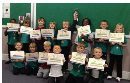
Congratulation to students in Year 2 and 1 at Oakley Vale Primary School who took part in the Pacesetters football competition at Kettering Sports Arena and came first and fourth respectively.